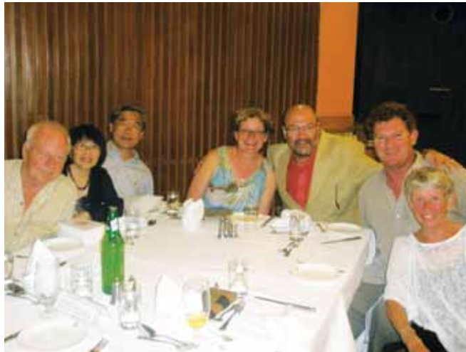
The September 2011 SPIRIT of INDIA group