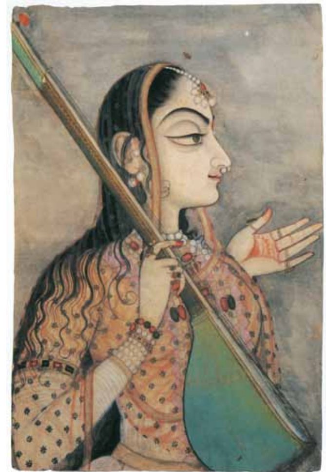
Front Cover: Lady Singing, Rajasthan, 17th century

For the traveller keen to understand an ancient but thriving rich Asian civilisation