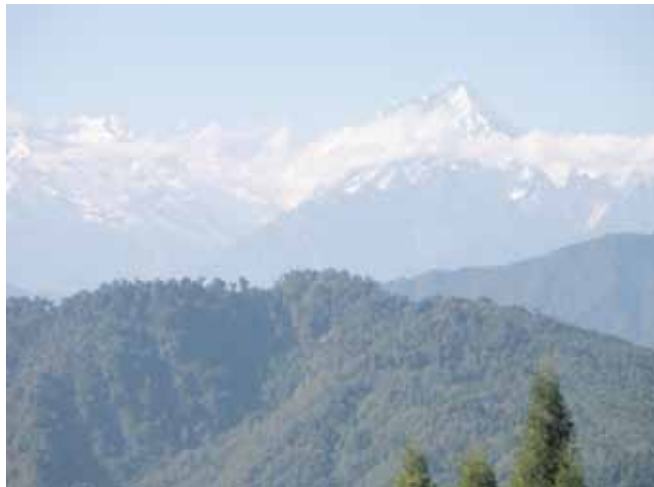
Darjeeling: Kanchenjunga, the 3rd tallest peak