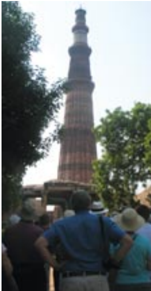
Qutab Minar (Victory Tower), New Delhi