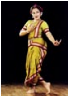
SONAL MANSINGH (Orissi Dance 82, 05)