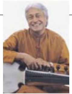
AMJAD ALI KHAN (Sarod 86, 2003, 06)