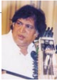
SULTAN KHAN (Sarangi 2004)