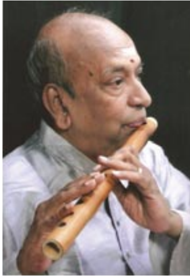
Dr NATESAN RAMANI