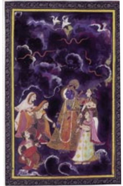
The musical mode Raga Megh Malhar