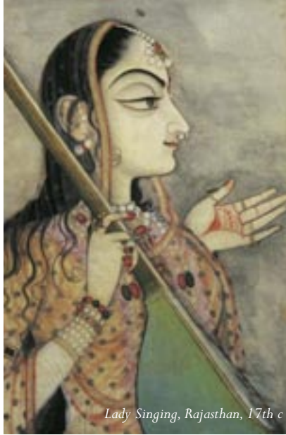
Lady Singing, Rajasthan, 17th c