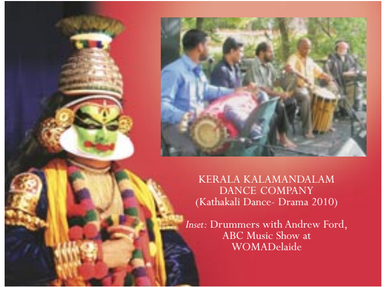
KERALA KALAMANDALAM DANCE COMPANY (Kathakali Dance- Drama 2010)