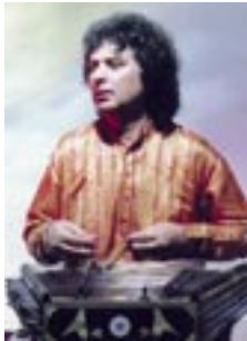
SHIVKUMAR SHARMA (Santoor 88, 94, 99, 2007, 12)