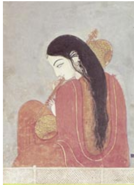
Lady playing the Veena

Pandit Shivkumar and his ensemble will present a selection of traditional classical ragas. As is customary, they will announce the ragas they will play on the evening.