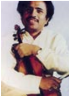
L SUBRAMANIAM (Violin 92, 2000, 06, 11)