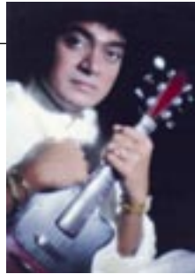
U SHRINIVAS (Mandolin 2002, 09)