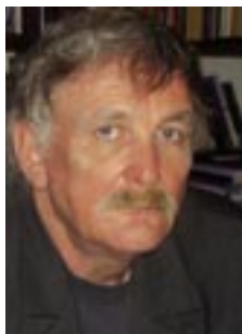
PAUL COX Film Director