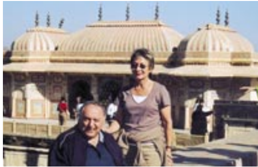
September 2011 group in Varanasi